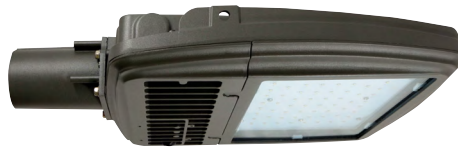
Shown with "ALMAA" Pole Mounting Arm Adaptor, Die-Cast Adaptor for 2 3/8" Horizontal Mounting Arms, Bronze Powdercoat Finish, Includes Hardware.