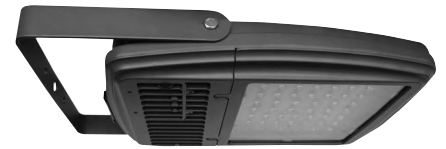
Shown with "STY" Yoke, Stamped Heavy-Duty Steel Yoke, Bronze Powdercoat Finish, Includes Hardware.