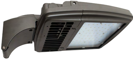
Shown with "STA" Stealth Mounting Arm, Stealth Die-Cast Mounting Arm, Bronze Powdercoat Finish, Includes Hardware. Mounts Directly to Square Poles.