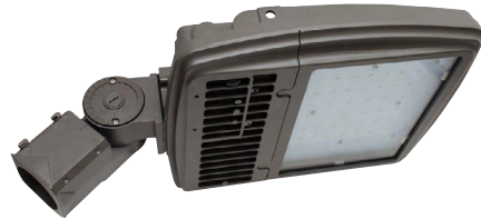
Shown with "SSF" External Mount Slipfitter, External Mount Die-Cast Adjustable Slipfitter for 2 3/8" Tenons, Bronze Powdercoat Finish, Includes Hardware.