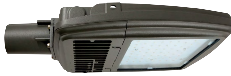
Shown with "ALMAA" Pole Mounting Arm Adaptor, Die-Cast Adaptor for 2 3/8" Horizontal Mounting Arms, Bronze Powdercoat Finish, Includes Hardware.