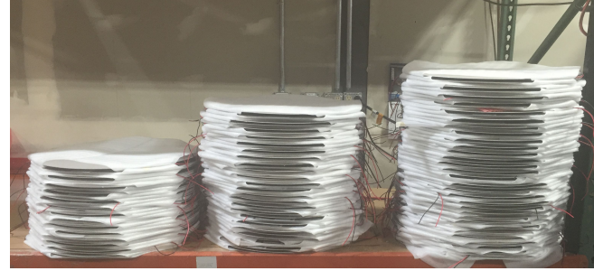
(Example only of custom LED insert)

The EnviroLux 90 Watt Custom Fit AMBER LED Retro Fit Kit is designed to replace HID lighting systems between 250w to 400w MH or HPS. Typical existing HID lighting applications include retail centers, industrial parks, schools and universities, public transit and airports, office buildings and medical facilities. Mounting heights of up to 30 feet can be used based on light level and uniformity requirements.