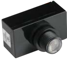
Button Photocell (PC1, PC2)